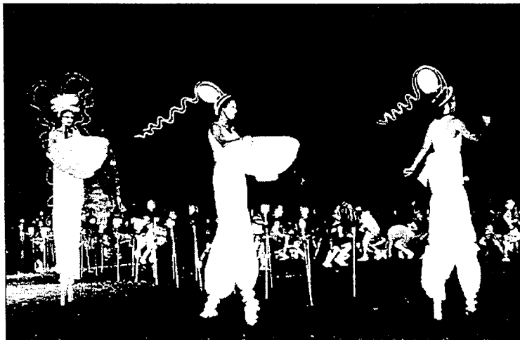
'Illuminations' - a Tasdance Community project.