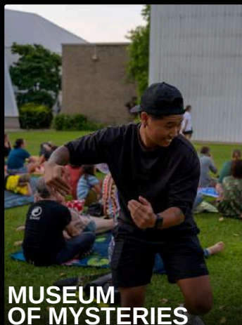
MUSEUM OF MYSTERIES