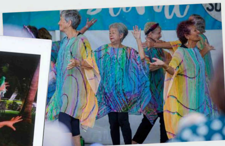
SEA BREEZE FESTIVAL 2024